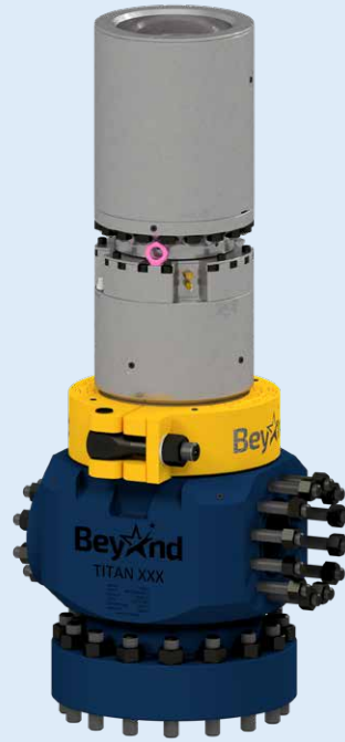
TITAN 5 WITH ARES 3090 DUSA