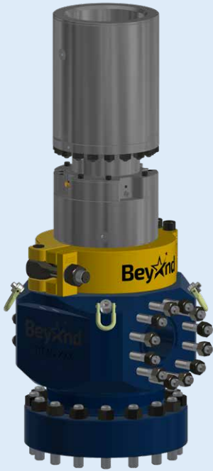
TITAN 5 WITH ARES 3078 DUSA