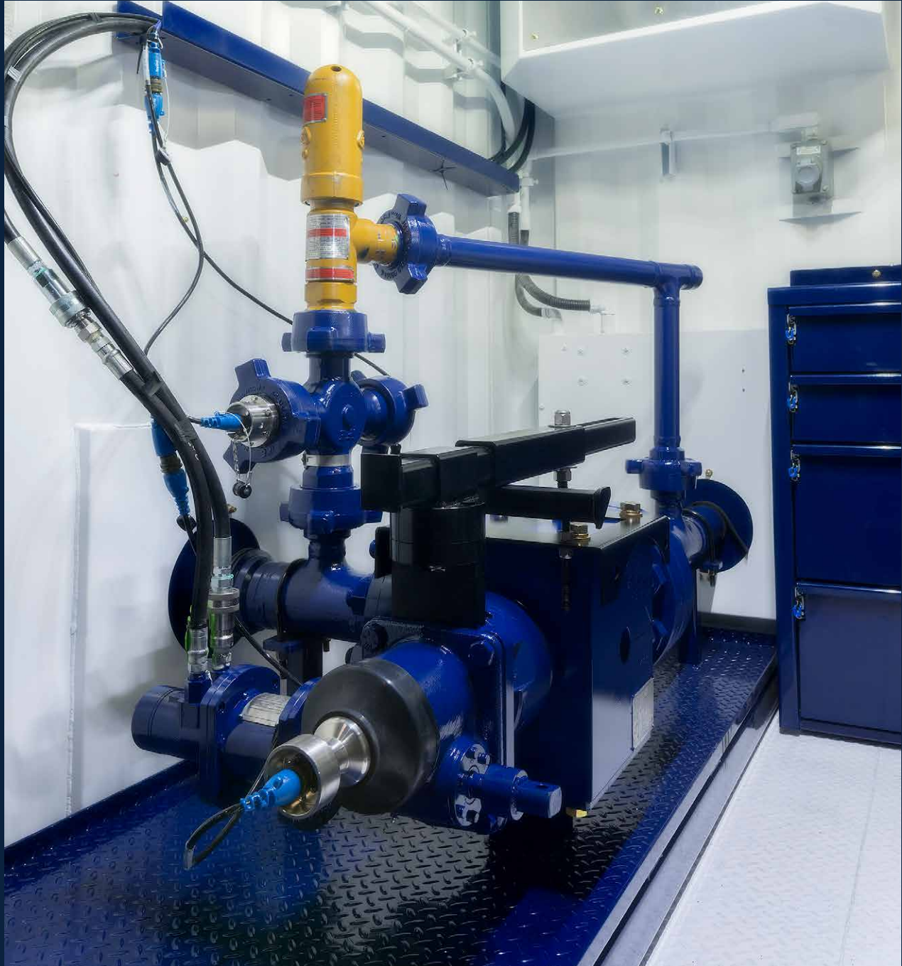
Electric choke & High-pressure relief valves