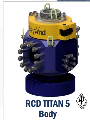
RCD TITAN 5 Body