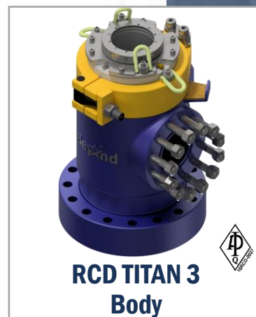
RCD TITAN 3 Body

* API Rotating flanges. Please inquire for Overall Height with ARES 3078 and ARES 3090.