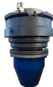
ARES 1578 Bearing Assembly