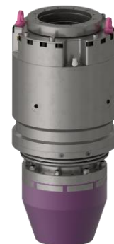
ARES 3090 Bearing Assembly