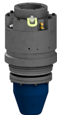
ARES 3078 Bearing Assembly